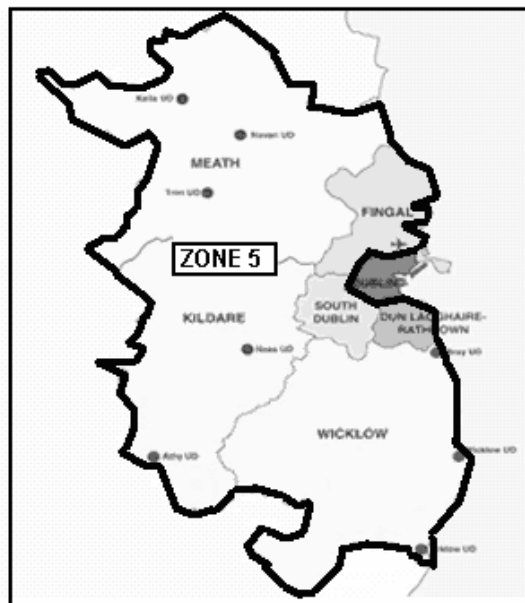
Figure 2: Map of zone 5

The population sampled was that of individuals who travel into the city centre to work each day. Therefore, it is assumed that respondents living in the outer zones travel a greater distance than those who are living in the closer zones on a daily basis. Based upon these assumptions a high coefficient value for the ZONE variable would indicate the further an individual has to travel, the more utility they derive from transport information option chosen.