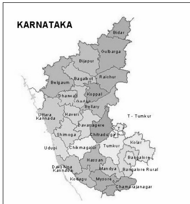
Figure 2: Map of the state of Karnataka