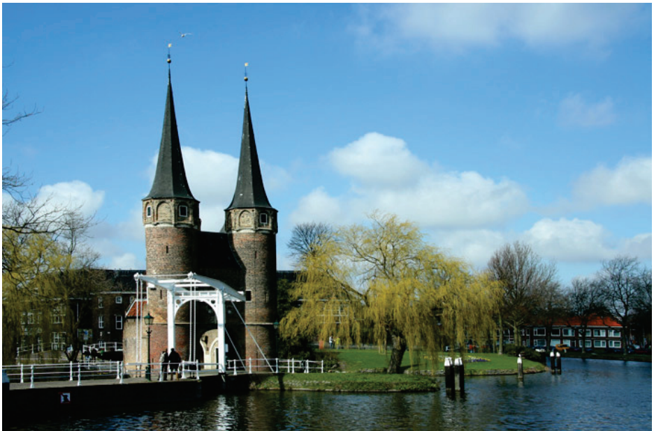
Oostpoort on the south-eastern edge of the city centre

The Local Organising Committee cannot accept any responsibility for personal accidents or loss / damage of private property of the participants. Participants are advised to take out insurance as they consider necessary.