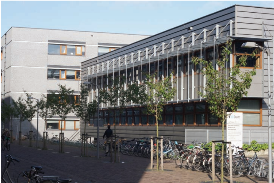
Faculty of Technology Policy and Management (workshops venue)