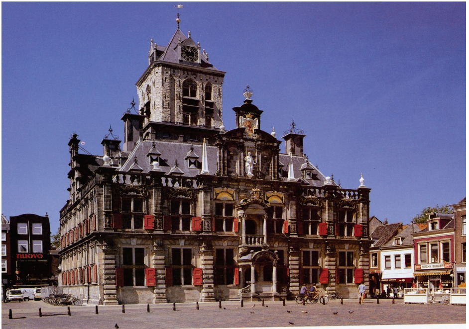
Town Hall at the Market

attractions. The tracks that started the second economic boom in the 1850 ´s are still there, raised since 1967 and ready to be brought underground before 2013. The industrial facilities have largely gone and were replaced with educational centers. The yeast factory has developed in the main microbiology lab of DSM. The region attracted educational centers of UN, Shell and Ikea, making knowledge Delft ´s main product. The yeast factory has become a microbiology lab in line with Leeuwenhoek and it is the link between history and innovation that typifies Delft. That is why the city is proudly carrying its motto: "Creating history".