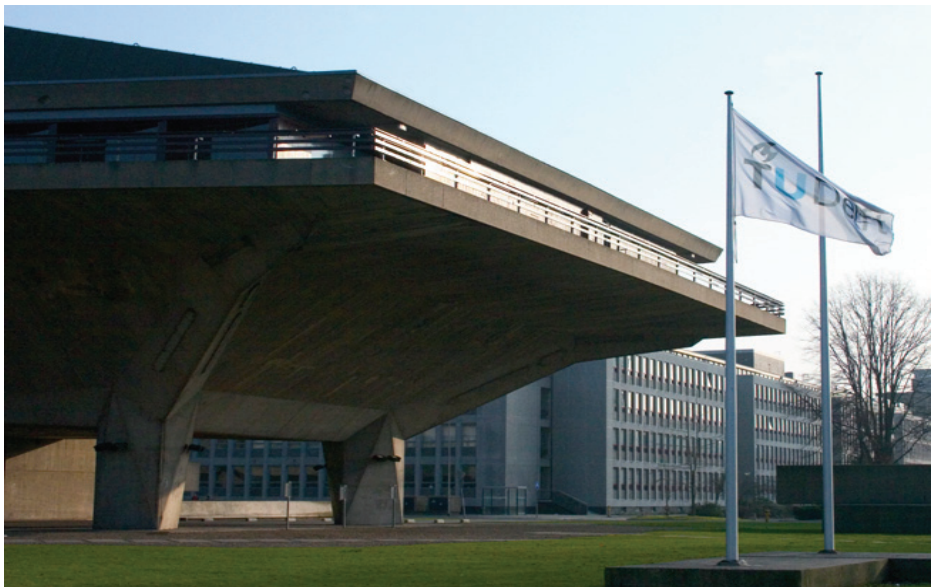
TU Aula Conference Centre, Delft University of Technology (plenaries venue)

Chairperson of the Department of Transport and Supply Chain Management (with a student compliment of more than 4000) and the Director of the Institute of Transport and Logistics Studies (ITLS(Africa)). This departmental research unit focuses on a range of research topics in collaboration with departmental researchers and industry partners. He has also been a specialist advisor to the organised bus industry in South Africa since 1989.