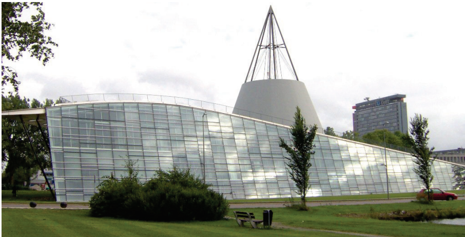
The library of Delft University of Technology

Recent feats are the Nuna (a solar car that won the World Solar Challenge in Australia four times in a row) and the experimental Superbus (a bus on a segregate lane designed to go at speeds up to 250 kph). The Times Atlas of Higher Education lists it within the top 20 of universities with a technology focus in the world.