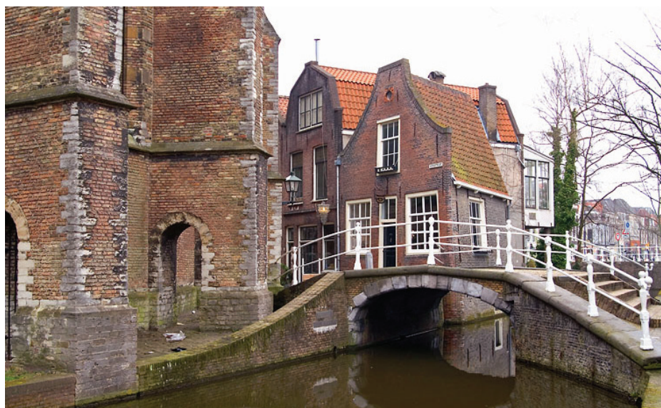
Kerkstraat bridge at the back of the New Church