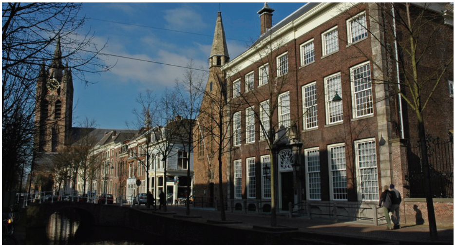
The Meisjeshuis (Girls house) at the Oude Delft, with the Old Church in the background

During the excursion there will be a brief moment to drop your luggage at Schiphol Airport.