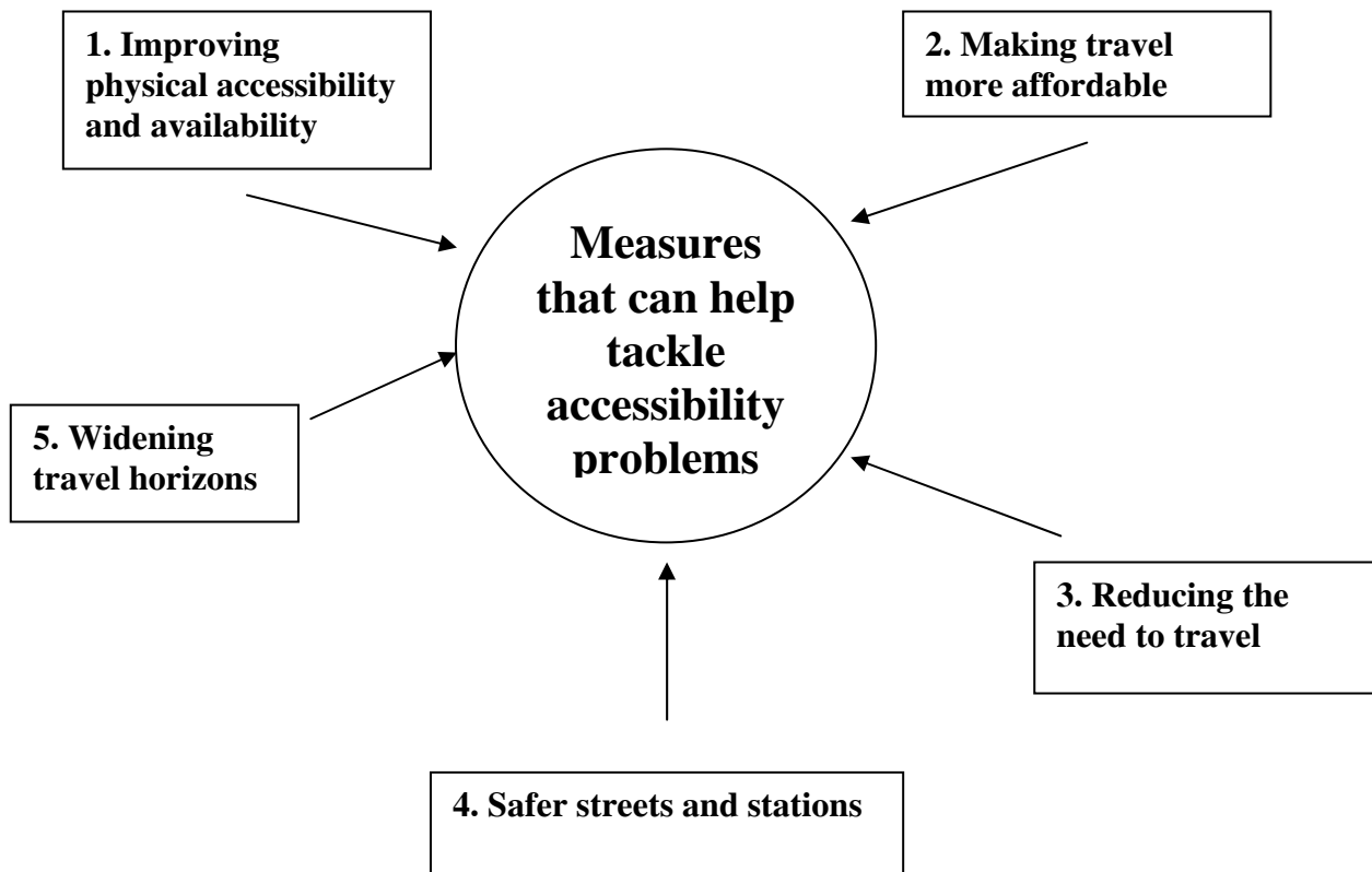
Figure 1 An Accessibility Planning Framework (drawing on SEU 2003, p.6)

The SEU argued that to remove these barriers and reduce social exclusion through transport improvements, there is a need to understand how people access key activities and link this with planning to improve such accessibility (accessibility planning), as well as undertaking key strategic policy initiatives, such as: